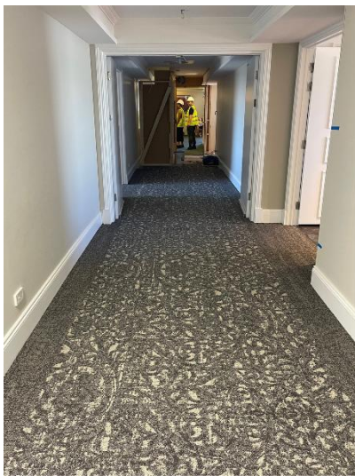
New carpet along the corridors