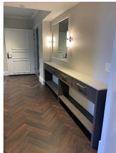
Builders clean has commenced in the suites